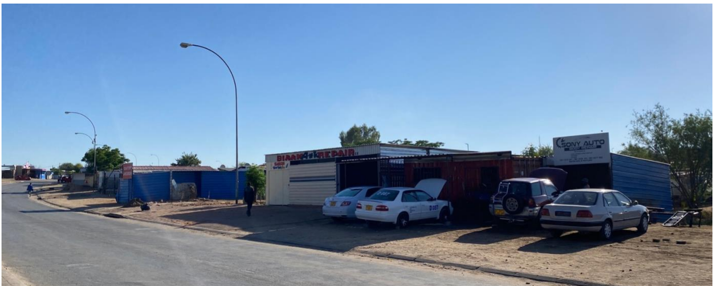
Fig 2: Barber, Salon & Auto-Repair shops on the North end of the Erf.

There are two auto-repair shops and a barber and salon built on the erf's premises. These are not part of the market however they would be incorporated in the master plan as they form part of the informal economy in the area.