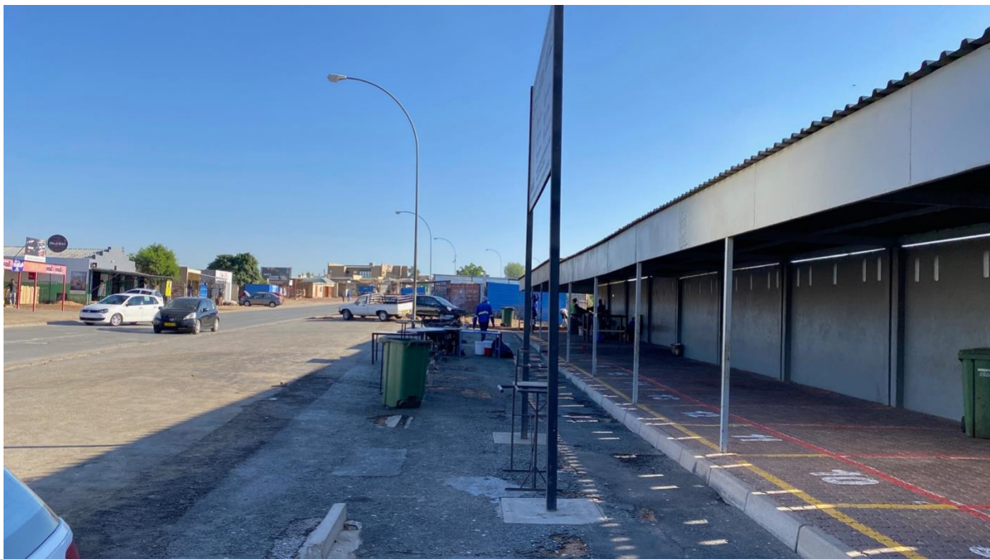
Fig 3: Market space.

The market usually has 4 traders for the 26 bays marked out on the floor in the covered area and two kapana traders in the threshold space between the parking and the building. This is a sign that the market is not attractive for traders and a design intervention is required.